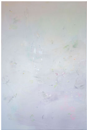
Walking (self portrait), 2019/ 2020 Oil on canvas, 150 x 100 cm