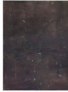
Jungle Water, 2018/2019 Oil on canvas, 167 x 125cm