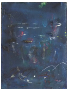
Glass 3, 2020 Oil on canvas, 24 x 18 cm