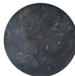
Round painting (black), 2019 Oil on canvas, diam. 45cm