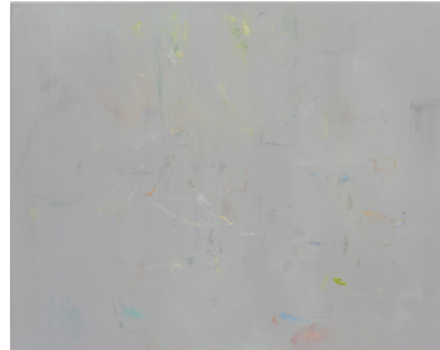
Rome Atelier with Pim, 2016 Oil on canvas, 80 x 100 cm