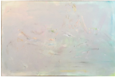
Mermaid, 2020 Oil on canvas, 100 x 150 cm