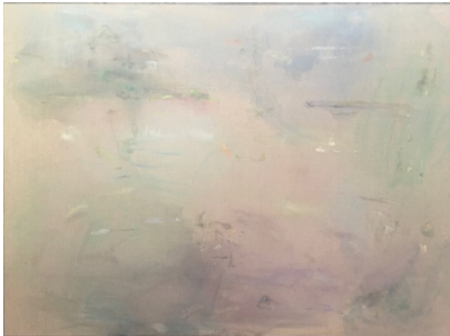
Max in the Orankesee, 2019 Oil on canvas, 120 x 160cm